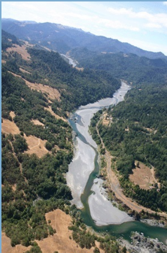
Coho salmon spawn in the South Fork of the Eel River.

Eel River Wildlife Area's Ocean Ranch Unit, owned and managed by the California Department of Fish and Wildlife, is located on the northwest portion of the Eel River estuary, about 13 miles south of Eureka, California. The Ocean Ranch project will restore tidal processes at the 375-acre Eel River Wildlife Area-Ocean Ranch Unit. The project will breach and/or remove levees to restore tidal prism and increase estuarine habitat for the benefit of north coast fish and wildlife, including coho and Chinook salmon, steelhead, and cutthroat trout.