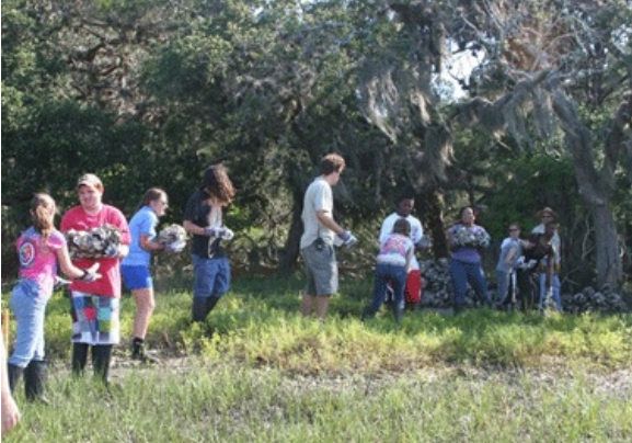
Students transport bagged shell to the river to build the reef.

Eel River Estuary Preserve Historically a network of extensive tidal marshlands and dunes, today the Wildlands Conservancy's Eel River Estuary Preserve encompasses an assortment of environments including tidal marsh, dunes, agricultural land, estuarine, and freshwater ponds that provide diverse habitat for a complex of species. Preserve will provide abundant opportunity for enhancement of estuarine and tidal marsh habitat and the fish, wildlife, waterfowl and rare plant species that are dependent on these habitats.