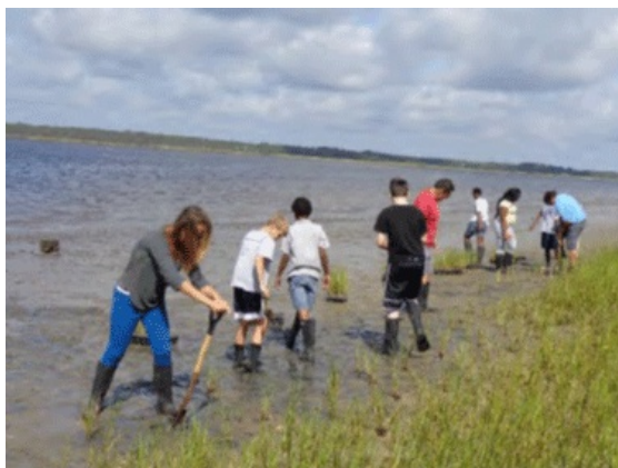
SJTHS students planting marsh grass.