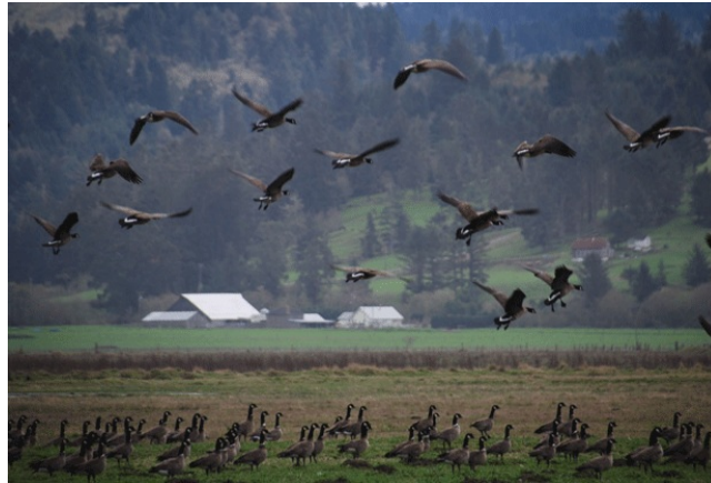
Canada geese in the Eel River Delta.