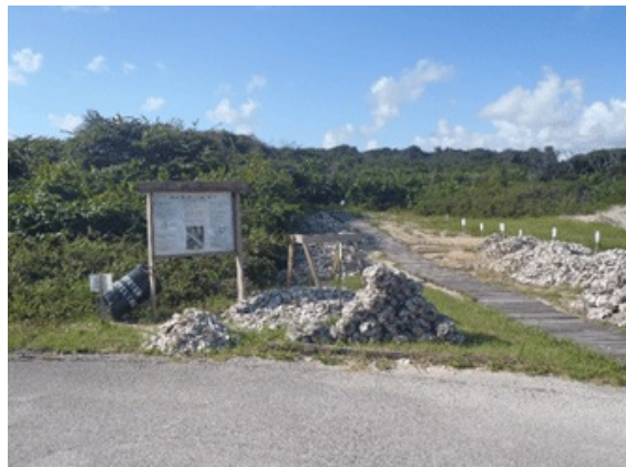
Oyster Shell Recycling Staging Area.

The GTMNERR Community Oyster Shell Recycling and Living Reef Construction Project was successfully initiated through the Friends of the GTM Research Reserve's partnership with the St. Johns Technical High School (SJTHS) . Nestled within an easily accessible spot in the Reserve, off to the side of a parking area off of the A1A Hwy., piles of shell that have been collected from area restaurants are processed. Each pile has a small sign above it noting the date the shell was placed (the top date) and the date the shell will be ready for harvesting and reuse. In Florida, the oysters are required to bake in the sun for 90 days and are raked during that time to remove bacteria and pathogens and to prevent any potential cross-contamination, as many oysters sold in area restaurants are not actually local, but brought in from other states. Students from the St. John's Technical High School and many others have helped with the oyster raking and bagging.