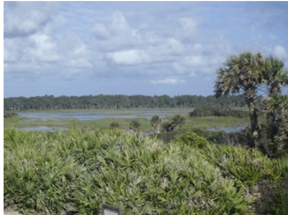
View of the GTM NERR.

"Over time, the area has been impacted by water pollution, increasing wave action as a result of river traffic and channel dredging, other human-induced factors, and sea level rise," stated Andrea Small, aquatic preserve manager and lead on this project at the Reserve. "These restoration projects will not only provide benefit to the ecosystem, but they are also an important way to connect the local community to the natural environment through volunteer and educational opportunities."