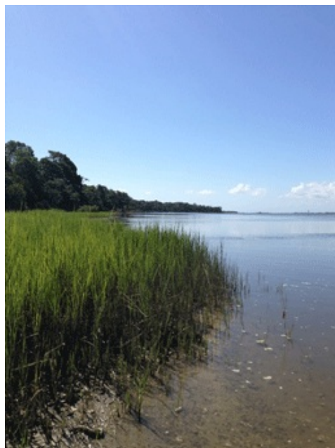
Shoreline at the oyster reef site on the Tolomato River.