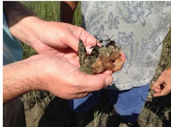
Oyster spat settlement at the reef.

Atlantic Coastal Fish Habitat Partnership | California Fish Passage Forum | Hawaii Fish Habitat Partnership | Kenai Peninsula Fish Habitat Partnership | Mat-Su Basin Salmon Habitat Partnership | Pacific Marine and Estuarine Fish Habitat Partnership | Southeast Aquatic Resources Partnership | Southwest Alaska Salmon Habitat Partnership | Western Native Trout Initiative