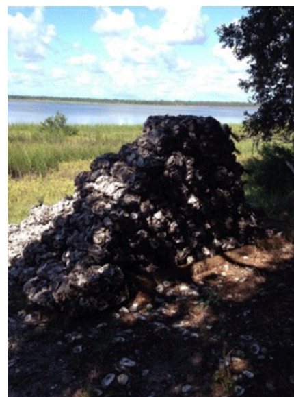
Oyster Shell Bags Awaiting Deployment.

Given time, the continuation of the oyster shell recycling program and the expansion of the reefs at the Reserve, it is hoped that there will be ever increasing numbers of oysters supporting a variety of aquatic life in the area for years to come.