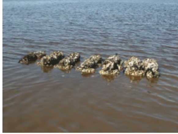
A section of installed oyster reef.