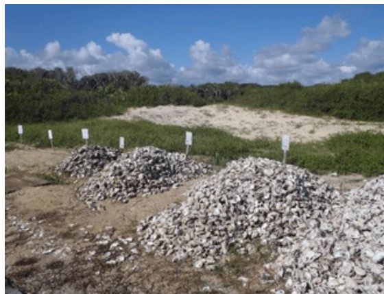
Oyster Shells Being Processed.

SJTH has an Academy of Coastal and Water Resources that was established in 2011 and is dedicated to providing students with high quality, industry relevant curriculum to assure success in post-secondary education and coastal and water resources career opportunities. Through collaboration with business partners, students are engaged in applied learning and develop confidence, long lasting relationships and a sense of community. Students participate in a STEM program of study that focuses on coastal, environmental and water resources and a valuable hands-on curriculum designed in partnership with the St. Johns County Utilities, Guana Tolomato Matanzas Research Reserve, Florida Gateway College, and Jacksonville University's Marine Science Research Institute. They explore the environment and ecosystems through environmental and water resource classes and experience water quality testing, wetland management, wildlife, and fisheries management. In discussions with Linda Krepp, SJTHS Career Specialist and Principal Wayne King, the hands-on learning opportunities afforded by the restoration projects and work experience, have actually had a tremendous impact by offering project-based learning opportunities. At the outset of the project, then SJTHS Principal Wayne King expressed his enthusiasm for the program.