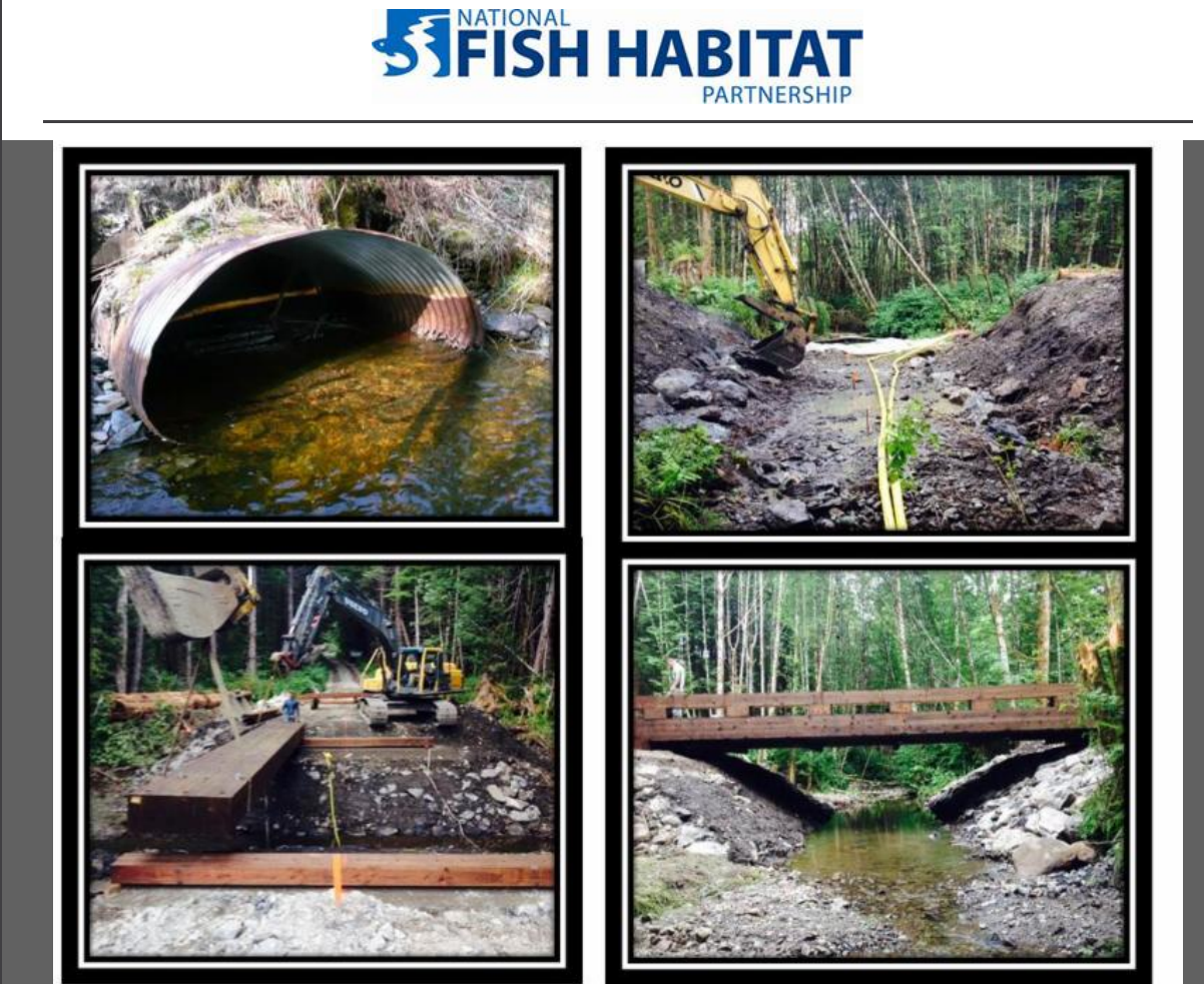
River herring (alewife and blue back herring) range along the East Coast and have supported one of the oldest fisheries in the United States.