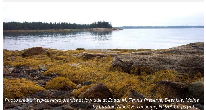
Kelp-covered granite at low tide at Edgar M. Tennis Preserve, Deer Isle, Maine