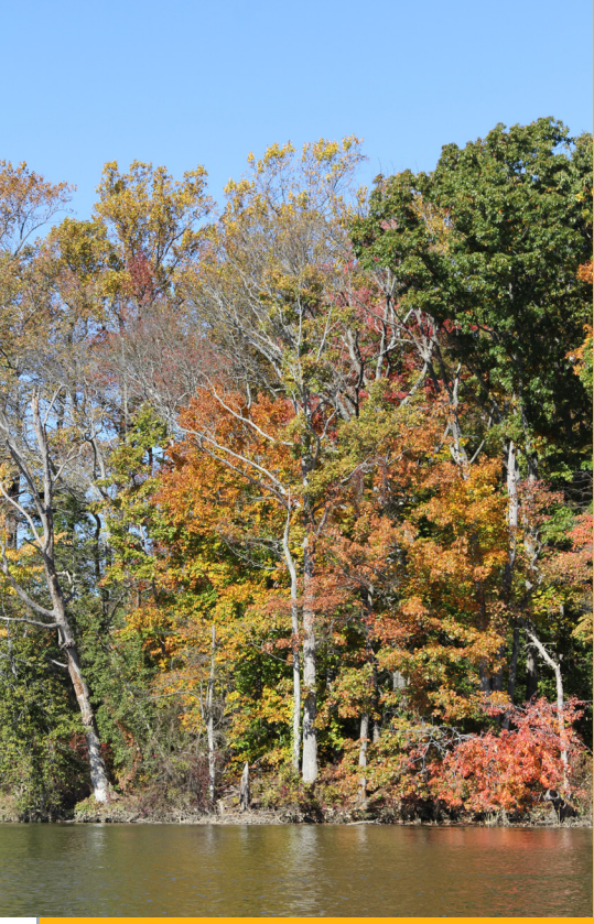
Low order coastal streams

Rivers in which the dominant substrate is fine sediments (silt, mud, sand). The stream slope is between 0.51% and 2%. This characterization includes 4th order rivers and above.