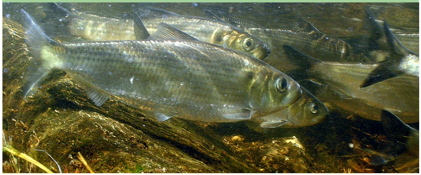
Jerry Prezioso, NOAA Fisheries

All of these threats can be cumulative, which can possibly cause irreversible changes to the ecosystem.