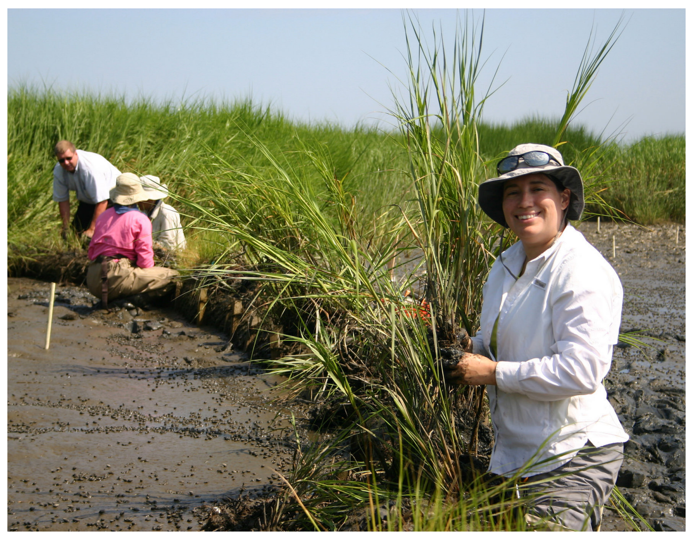
Partnership for the Delaware Estuary, courtesy of The Milford Beacon