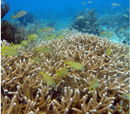
FL Keys Reef Restoration, FL FWCC